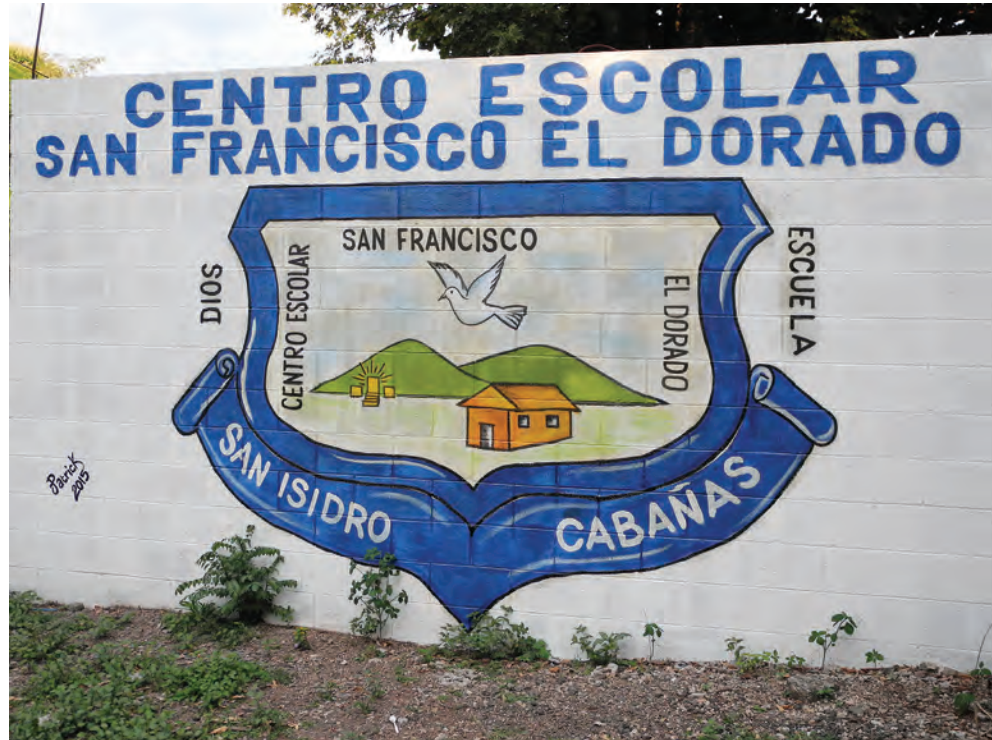
School wall San Isidro, Cabañas.

a list of potential employees, thus generating expectations that they will eventually receive jobs with the company. 40 More importantly, these future employment opportunities are being presented as contingent on a resolution in the ICSID case that favors the mining company, i.e., a decision that compels the Salvadoran government to reverse its promise not to issue new mining permits. This information is misleading, since ICSID cannot force the government to change its laws, policies, and practices with regard to mining. Furthermore, whatever decision ICSID makes, one of the parties is likely to seek its