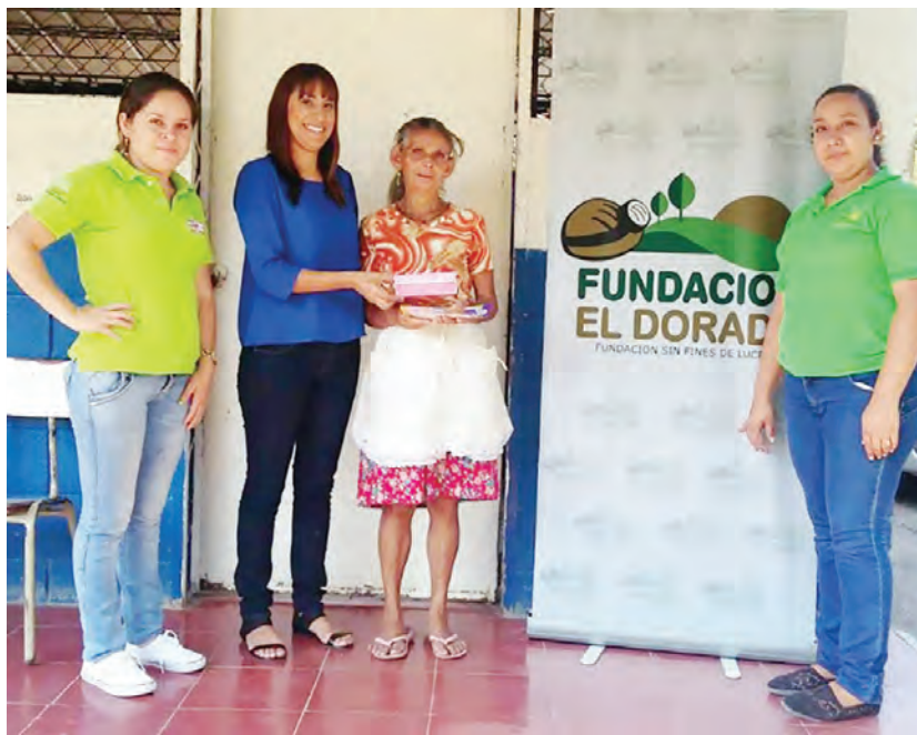
'Success stories: We can take care of women's health'