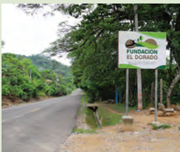
Fundación El Dorado billboard.