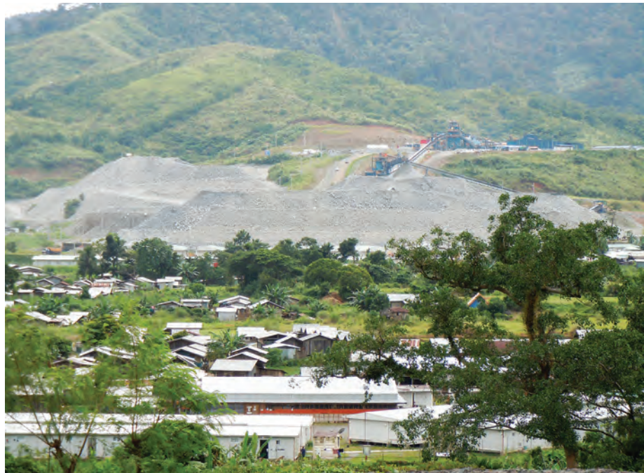
OceanaGold’s Didipio open-pit copper and gold mine in the Philippines.

“OceanaGold is strongly committed to nearby communities through focused programs, principally in holistic education, health, environmental improvement, the promotion of a culture of peace and promotion of entrepreneurship.” 22