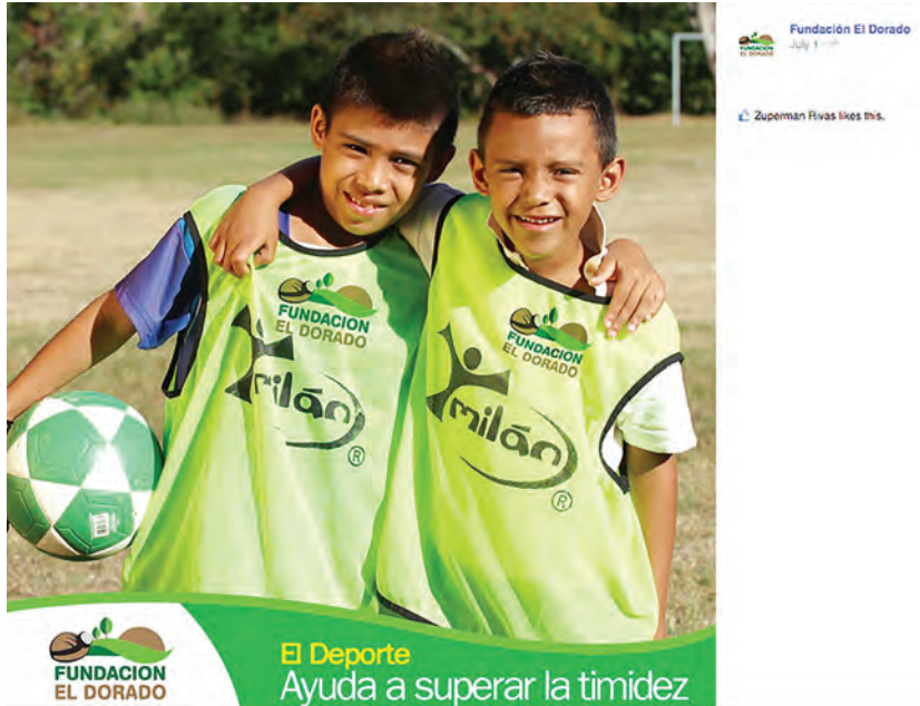
El Dorado Foundation: 'Sports, overcome shyness'