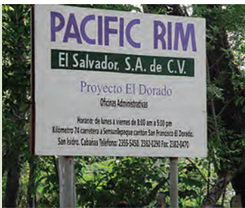
Pacific Rim Billboard in front of company gate in San Isidro, Cabañas.