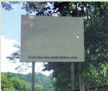
Blank billboard after Pacific Rim was acquired by OceanaGold.