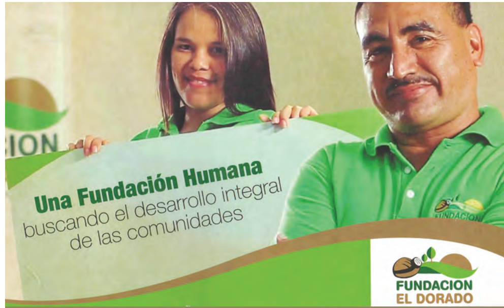
Cover El Dorado Foundation brochure

Not only are these activities designed to enhance the reputation of the company, but they may also be intended to neutralize its critics.